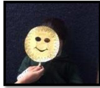
Out came the sunshine and dried up all the rain...