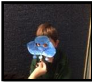
Down came the rain and washed poor Incy out!