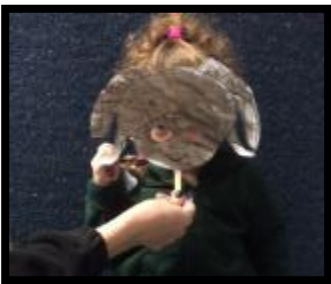
Incy Wincy Spider went up the water spout...